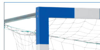
Sturdy aluminium frame