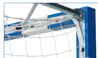
Reinforced corner joints