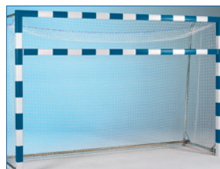
Height reducing removable crossbar

300x200 cm, meshes 10x10 cm, designed for free hanging suspension in net support brackets. Ball stop net, to be suspended in the goal, at approx. 40 cm from the net. Per piece.