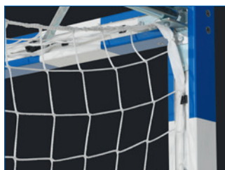
Net for IHF handball goal